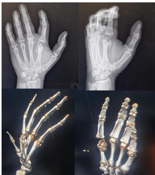
Fig. 1. Pre-operative X-rays and CT scan.

Upon arrival in the emergency room, he underwent a total body computerized tomography (CT) scan, radiography in two projections of the left hand, and subsequent CT scan of the hand with three-dimensional (3D) reconstructions. Tests performed revealed a cerebral hematoma. He also reported a fragmentary articular fracture of the distal end of the second metacarpal bone (Fig. 1).