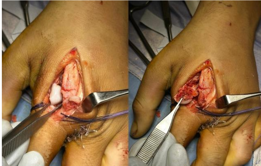
Fig. 2. Damage assessment during surgery.

The surgical procedure consisted of an “on-the-table” reconstruction of the metacarpal head, bone grafting with autologous bone to reconstruct the metaphysis using fracture fragments supporting the metacarpal head, and performing the ORIF (open reduction and internal fixation).