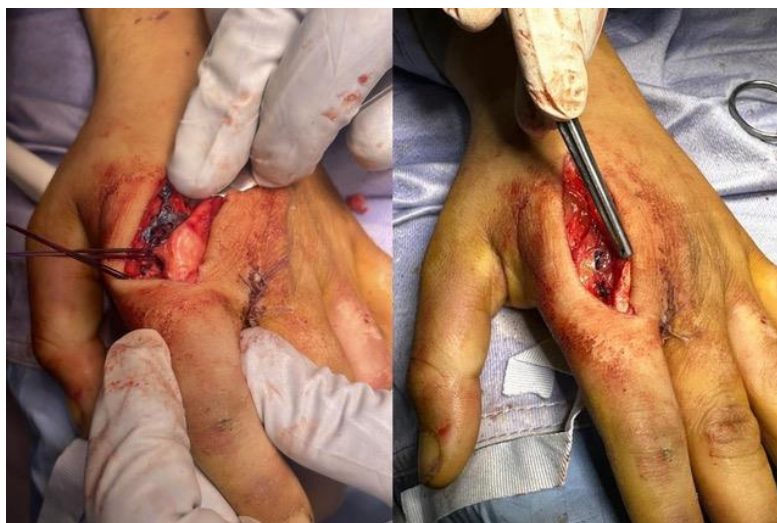
Fig. 7. Sagittal band and extension system reconstruction.

At the end of the procedure, the sagittal band and the intermetacarpal ligament were reconstructed as far as possible (Fig. 7). The tourniquet was released, and an accurate hemostasis was conducted before the skin suture.