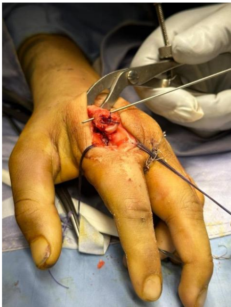
Fig. 3. Metaphyseal reconstruction of the second metacarpal bone.

The bone surfaces were then bloodied and the bone graft was implanted, taking care to arrange the cortical anteriorly and trying to regain the physiological metacarpal bone length. Bone fragments were customized to fit at best the bone loss (Fig. 3). Then, the second metacarpal head was re-composed using micro-forceps and a temporary K-wire of small diameter (0.6mm) (Fig. 4).