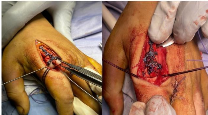
Fig. 5. Joint surface reconstruction and ORIF.