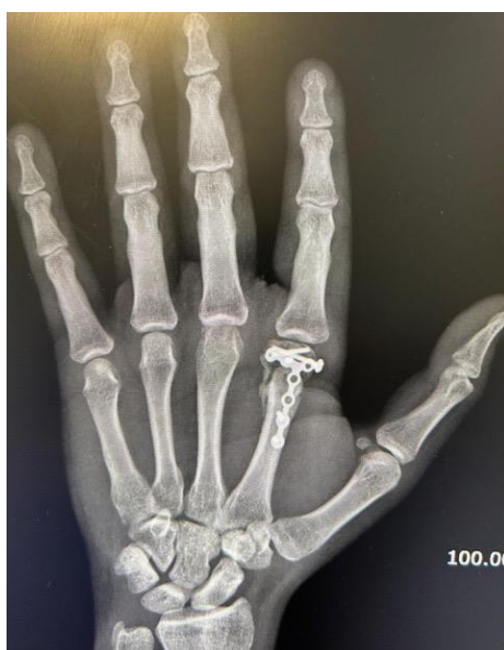
Fig. 8. X-ray at 1-month follow-up.

At the check-up 3 months after the surgical procedure, the plate and screws appeared in place with no more bone graft resorption. The patient reported no pain and improvement in the second finger's range of motion. Scars were in order. He returned to manual work. The DASH score was 47, VAS 5 under exertion, and 2 at rest. At 6-month follow-up, tools were in place with complete bone healing, without further resorption of the bone graft (Fig. 9).