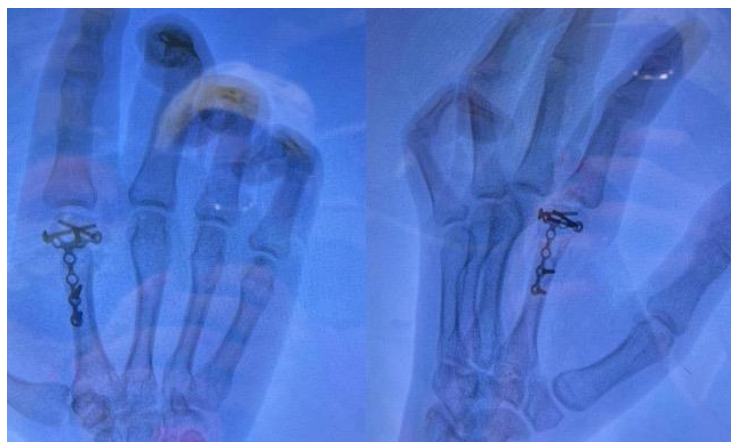
Fig. 6. Post-operative X-rays.

At the end of the procedure, the sagittal band and the intermetacarpal ligament were reconstructed as far as possible (Fig. 7). The tourniquet was released, and an accurate hemostasis was conducted before the skin suture.