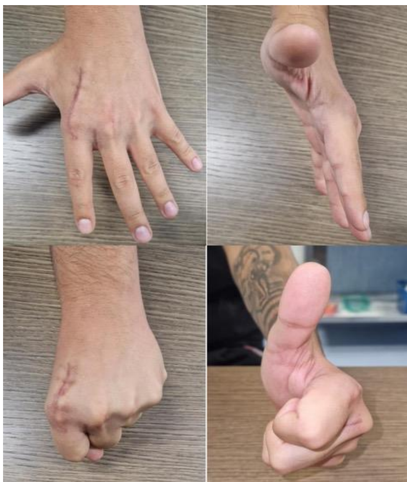
Fig. 10. Clinical examination at 6-month follow-up.

The second finger's length was satisfactory, with no rotation defects. The patient did not show any deficit of the second finger extension with a mild metacarpophalangeal joint flexion deficit, which was well tolerated (Fig. 10). He was then judged clinically and radiographically healed. The DASH score was 23, VAS 2 under exertion, 0 at rest. A strength test (JAMAR test) was also performed, and a force equal to 37 kg was generated with the grip.