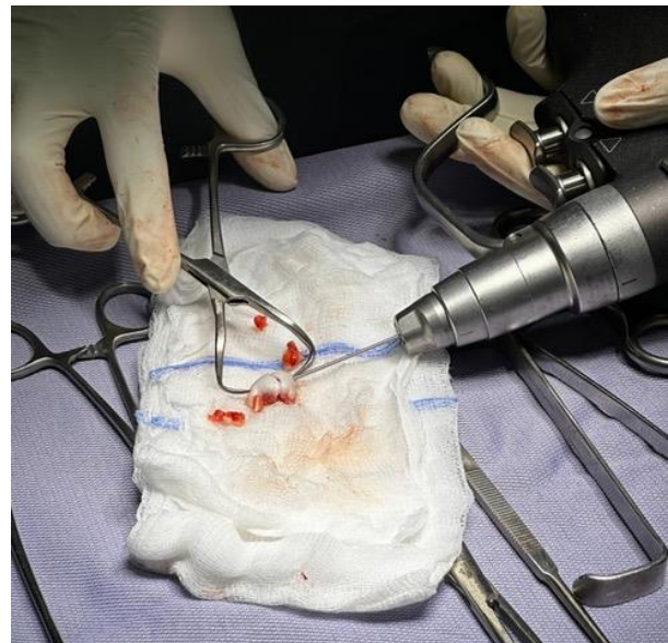
Fig. 4. On-the-table reconstruction of the second metacarpal bone head.

The reconstructed head was placed on the grafted second metacarpal metaphysis (Fig. 5). Finally, osteosynthesis was performed with Hofer (GMBH & CO KG Jahnstrasse, Fürstenfeld, Austria) INTEOS® Mini fragments metacarpal plate 2.0mm 4+4 holes and angular stability screws, under x-ray fluoroscopy control (Fig. 6).